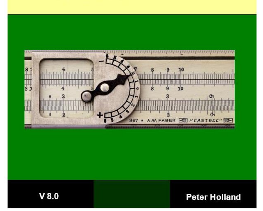
Every slide rule ever made by A.W. Faber and A.W. Faber-Castell